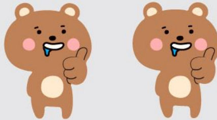
OFF PRODUCT CONSIDERED PERFECT. NO REPRINTS WILL BE DONE