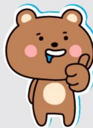
BE EXTRA CAREFUL IF YOUR BACK- GROUND COLOR IS DIFFERENT.