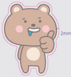
KISS CUT SHAPE