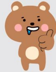
MORE THAN 1mm OFF PRODUCT CONSIDERED FAULTY