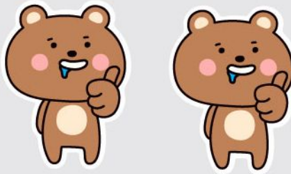
1mm OFF PRODUCT CONSIDERED PERFECT. NO REPRINTS WILL BE DONE