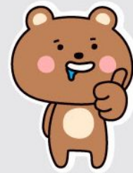
MORE THAN 1mm OFF PRODUCT CONSIDERED FAULTY