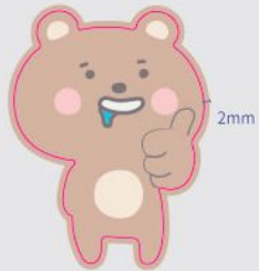
KISS CUT SHAPE