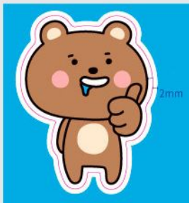
CORRECT 2mm from the image and 2mm from the background